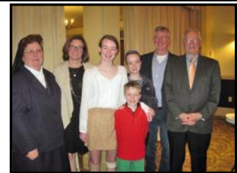
Second Place Winner