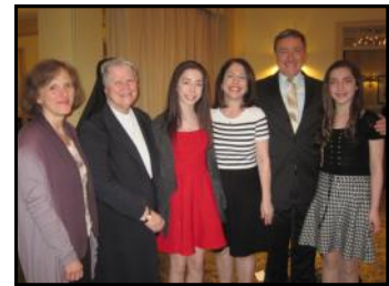
First Place Winner

A heartfelt thanks to all who participated and our Delchester Serra Club members who helped throughout the various phases of this project.