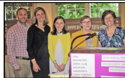
Second Place Winner