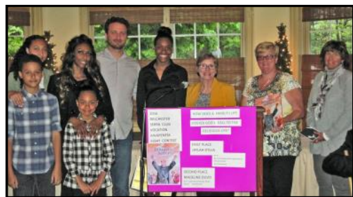
First Place Winner

A heartfelt thanks to all who participated and our Delchester Serra Club members who helped throughout the various phases of this project.